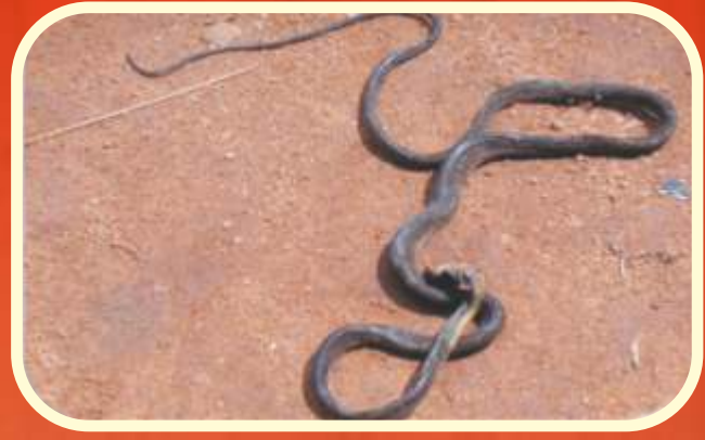
Deliverance from attack from snake that fell from the Tree during the Revival