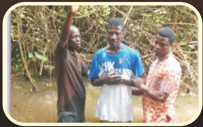
Baptizing one of the Converts