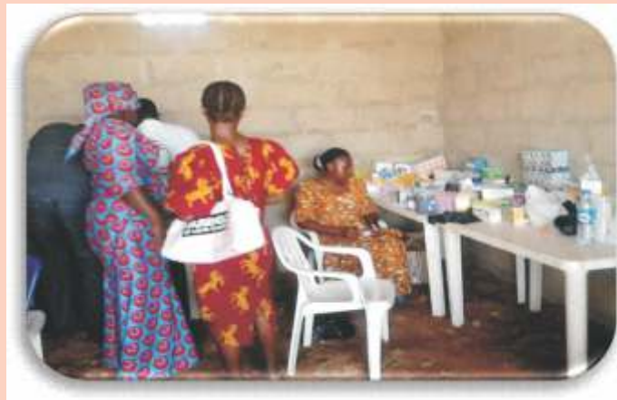
Pharmacist Dispensing Drugs To Patients