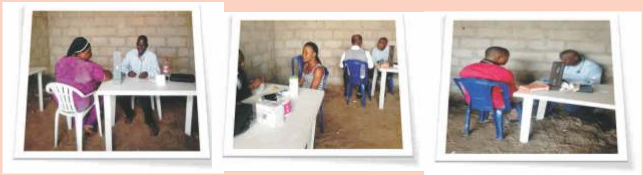
Doctors attending to patients