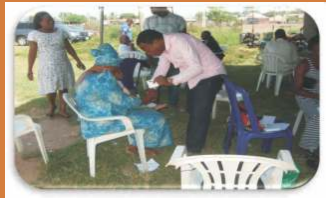
Prayer and Counseling session With the Patients