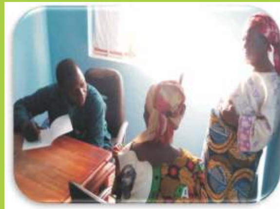
DOCTOR ATTENDING TO PATIENTS

through to the end of this year. It is our sincere prayer that the Lord would continue to shower His blessings on you and preserve you as a positive influence in the global task of world evangelism, particularly to the unreached and the forgotten ones in the hinterlands of Africa.