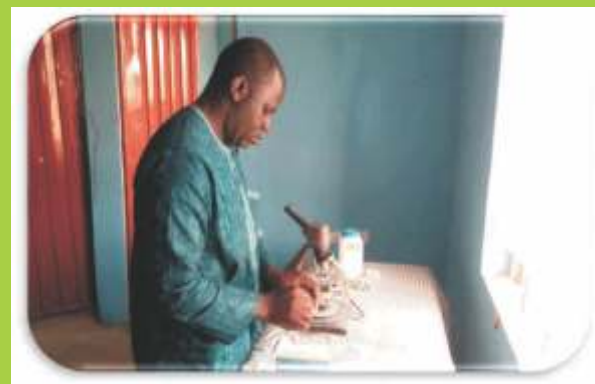
MINI LABORATORY IN THE CLINIC