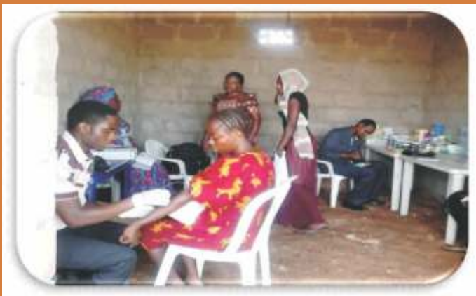
Blood Test for the Patient by the Med. Lab. Scientist