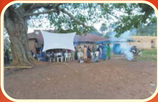
An Open Air Revival Service at Fada: The Smoke is set to Drive Away Biting insects.