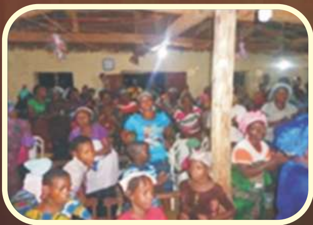
The Church Auditorium at Fada

God has helped us establish. Our base is at Fada Mission Field, a village in the interior jungle in Ona-Ara local government in Oyo State. The church has a population of over 100 (one hundred) people by now. Indigenous missionaries are trained from here to reach the unreached places with the gospel and it is among these people that God has chosen those to manage other fields that were established later (as narrated below)