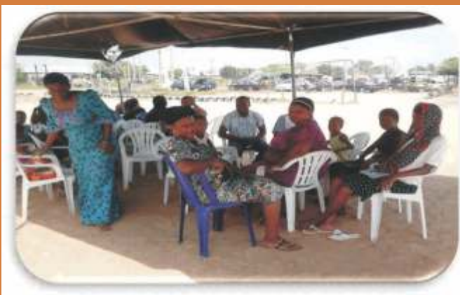
Patients Waiting to be Attended To by the Doctor