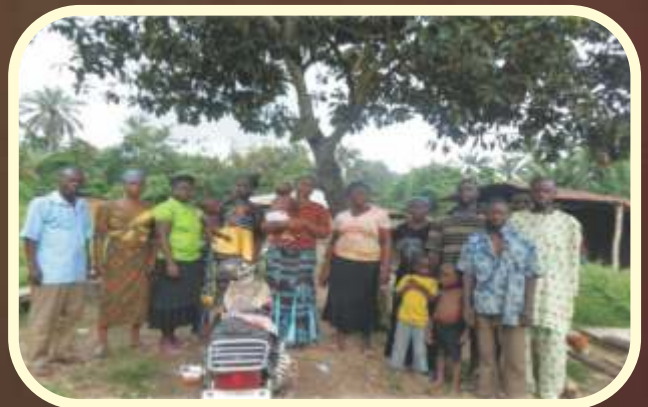
Fellowship at Odedele

In all we have 11 (eleven) missionaries working in these mission outreach posts, and we are looking forward to have more in the coming years.