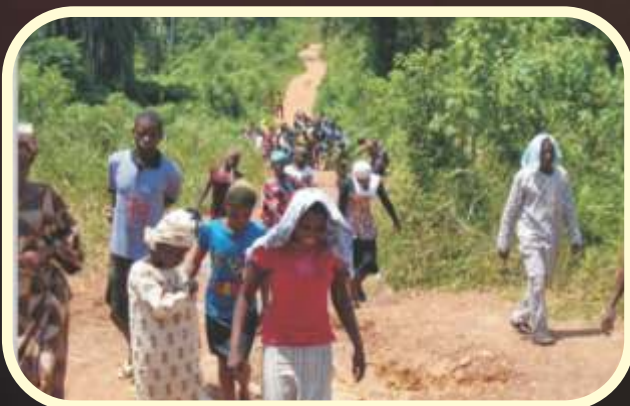
On the way to the River for Baptism