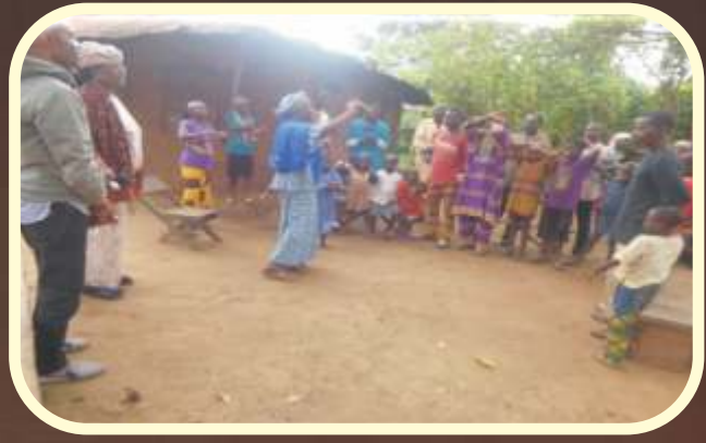
Fellowship Centre at Tukos

TUKOS MISSION FIELD: This field was established in January 2015. We are trusting God to get a land for fellowship centre in this village.