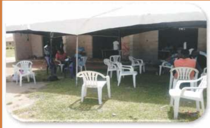
Venue of the Medical Outreach in Gwagwalada

Greenfield in partnership with Household of Love Church, Abuja organized a medical outreach in Gwagwalada on the 7 th of November 2015. This was carried out in collaboration with some Medical Personnel from National Hospital, Abuja.