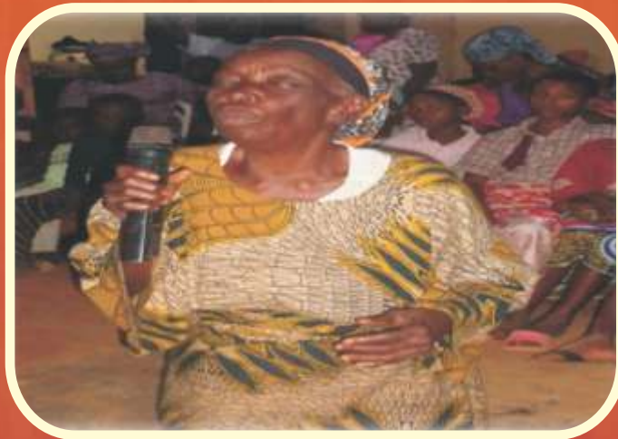
The woman who wanted to commit suicide